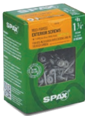
1 and 3 lb. Box